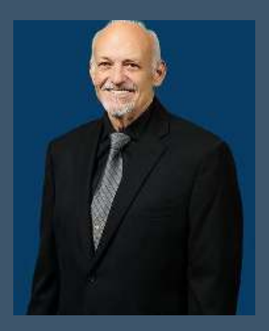
A Shared Vision for Advancing Physical Therapy in Nevada

2025 is shaping up to be a transformative year for physical therapy. By staying informed, embracing innovation, and committing to professional growth, you can position yourself and your practice for success.